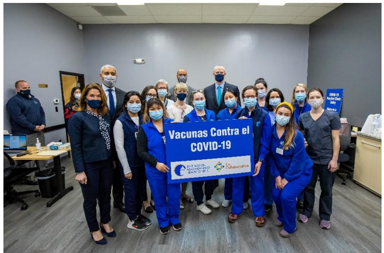
Gov. Baker, Lt. Gov. Polito, and EOHHS Sec. Sudders visited La Colaborativa, and East Boston Neighborhood Health Center today to announce new support for communities like Chelsea that have been hit hard by COVID-19.

This week, the Commonwealth and FEMA launched a partnership that designates the Hynes Convention Center in Boston as a federal mass vaccination site where FEMA will support the daily administration of 6,000 vaccine daily doses for an eight-week period. This collaboration includes vaccinations beyond the Hynes location, following a "hub and spoke" model which allows